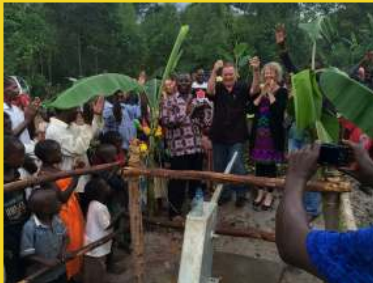
The ribbon (string) is cut. The well is officially open!