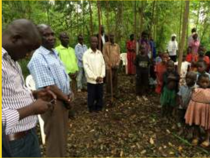
Gathering with the villagers to dedicate the well