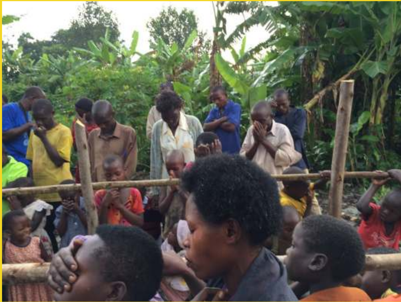
Thanking God for His provision of life giving water